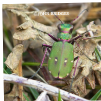
Green Tiger Beetle

This distinctive butterfly that holds its wings closed when at rest, shows only the metallic green underside of its wings. It can be seen from late April to mid July on heathlands, woodland clearings & rough grassland.