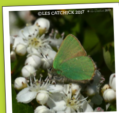
Green Hairstreak Butterfly

Do you spend time out and about in the Sherwood Forest landscape? Then why not join in with the Miner2Major citizen science monitoring project.